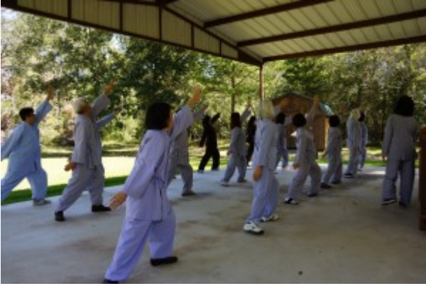
Qi Gong exercises