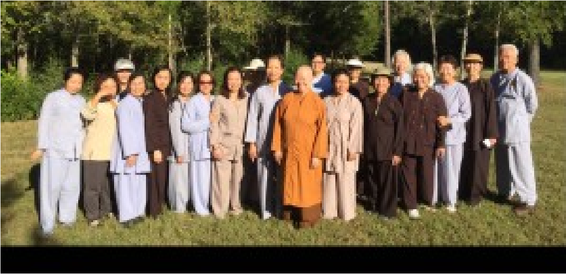
Group photo of 9-15 October 2016 meditation retreat participants